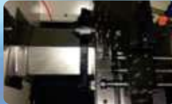
WITH GUIDE ATTACHMENT FOR LONG PARTS